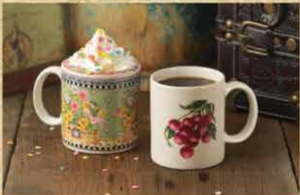
Coffee and Hot Chocolate

VISIT US ON FACEBOOK KaysCountryKitchenOrcutt & LET US KNOW HOW WE ARE DOING ON YELP