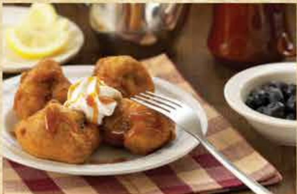
Hot Mess Muffin