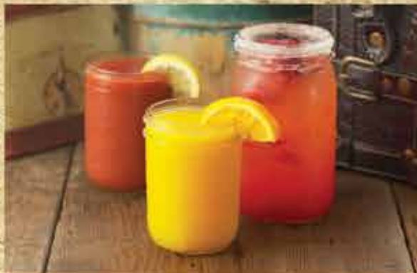
Famous Strawberry Lemonade & Variety of Fresh Juices